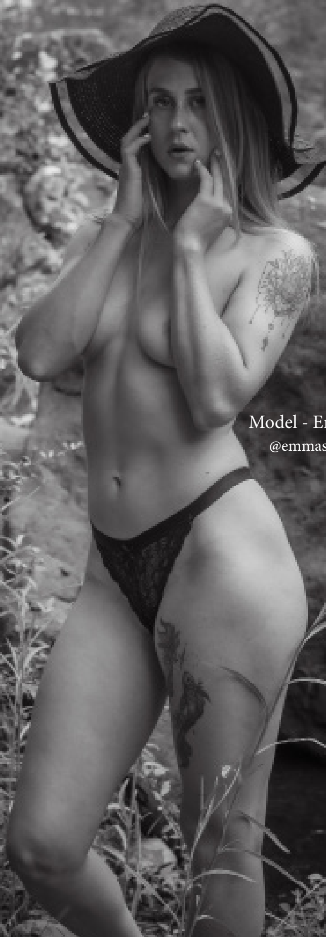
Model - Emma Tierney @emmasmodeling25